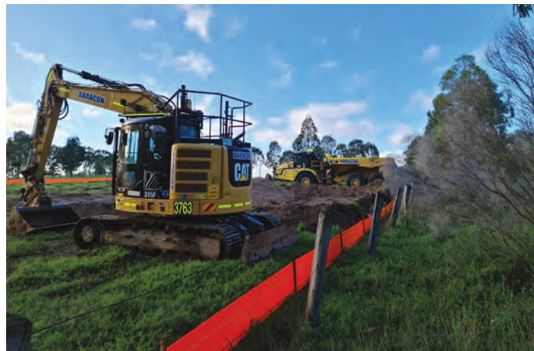
Daracon equipment now on site and in operation to establish facilities for use in the delivery of the Rail Loop Project.

"Facilities are currently being erected to provide construction water to the construction teams from existing on-site sediment dams and we have also erected fencing around all heritage and sensitive areas to ensure the protection of environmental and culturally sensitive locations," added Konrad.