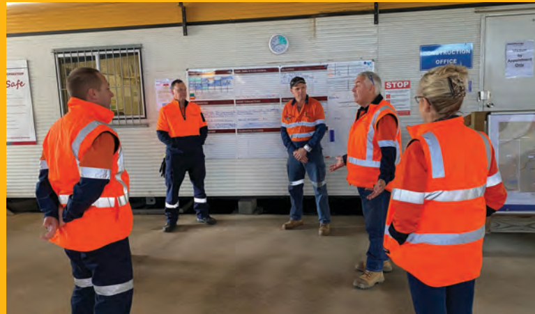
Members of the MPO Rail Loop Project team pictured during their daily PASS safety huddle.