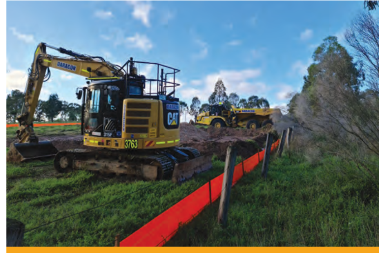
Daracon equipment now on site and in operation to establish facilities for use in the delivery of the Rail Loop Project.

"Facilities are currently being erected to provide construction water to the construction teams from existing on-site sediment dams and we have also erected fencing around all heritage and sensitive areas to ensure the protection of environmental and culturally sensitive locations," added Konrad.