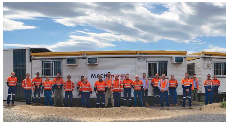
Daracon and Rail 2 Project team members on site at Mount Pleasant

The Contract to construct the R2P has been awarded to local civil construction business Daracon Group. Daracon will be responsible for the safe and efficient delivery of the rail loop infrastructure construction and signalling installation, commissioning to the Australia Rail Track Corporation network and the upgrading of Wybong Road. They will begin mobilising their equipment and personnel to site in late October with site works expected to commence in early November. Daracon was established in the early '80's and has offices throughout the Upper Hunter and various New South Wales locations.