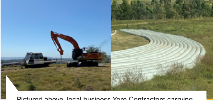
Pictured above, local business Yore Contractors carrying out pipe joining on the Rail Loop Project with the picture on the right showing the completed welded pipe.