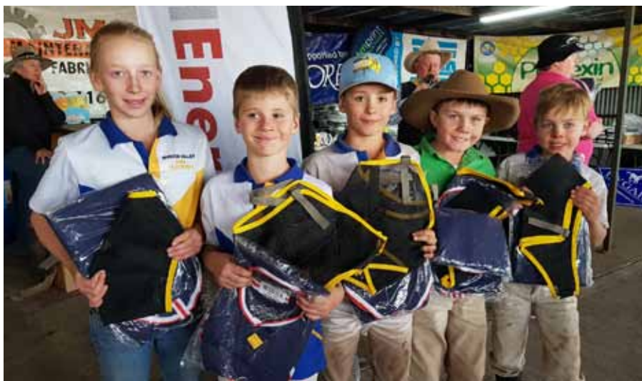
Some of the winners at the 2018 NSW Zone Polocrosse Championships in Muswellbrook.