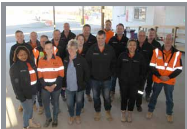
Some of the MACH Energy employees proudly displaying their 1,000,000-man hour celebration jackets.