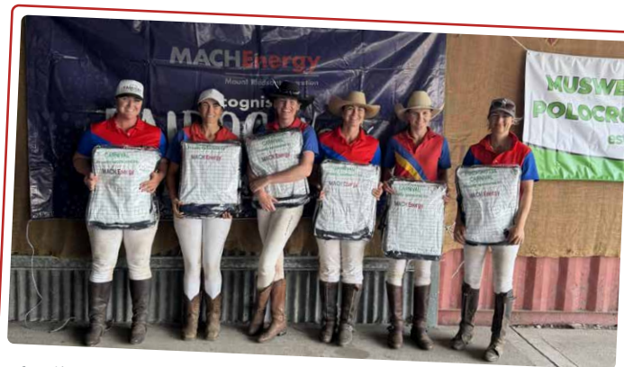
Continue support of the Muswellbrook Polocrosse Carnival