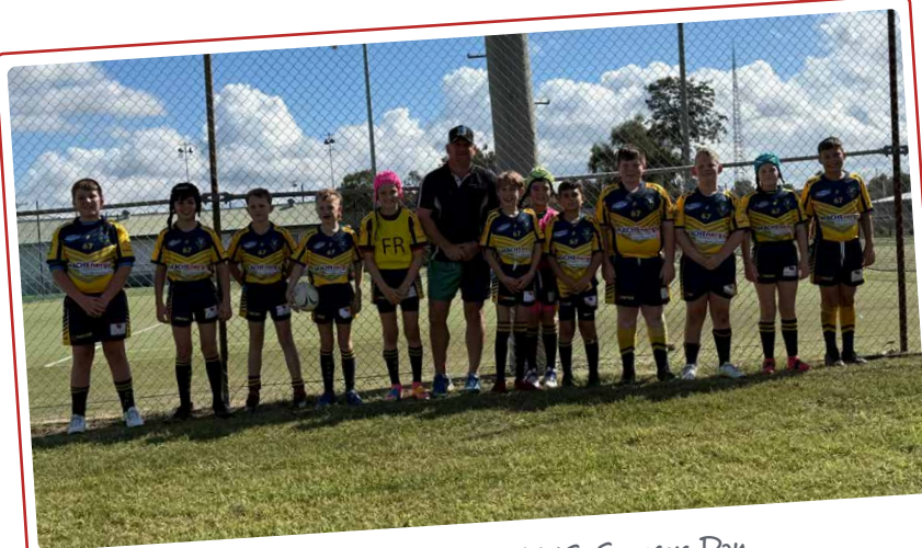
Muswellbrook Junior RAMS Sponsor Day