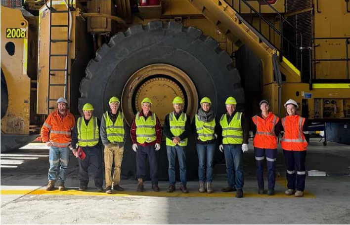
CCC Members and MACH representatives workshop tour

The Community Consultative Committee (CCC) continues to play a vital role in keeping communication open between MACH Energy and the local community. So far this year, two CCC meetings have been held, with the most recent in June conducting a tour of the recently constructed workshop. The tour provided CCC members with a firsthand look at the new facilities.