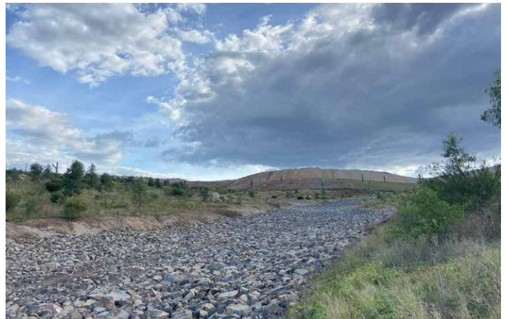
View of recent rehab from centre of waste dump system