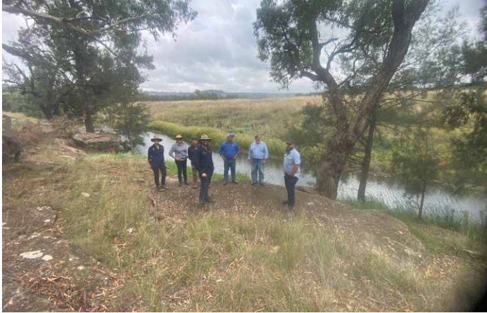
Cattle Creek Cassilis

The attendees enjoyed a quick coffee at one of Merriwa's local businesses before setting off for a tour. The group travelled to Cassilis, followed by visits to St Antoine and Wahrane, two of our significant Offset holdings. The tour highlighted several key sites and points of interest.