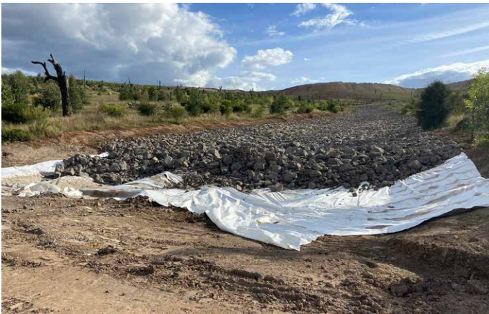
Rock drain construction

An additional 32ha of rehabilitation was completed in 2024. Rehabilitation includes shaping of the placed overburden to a natural geomorphic landform, placement of topsoil and ameliorants (gypsum), light ripping and seeding with a mixture of native grass and woodland species. Additionally, 6800 Hiko seedlings were planted.