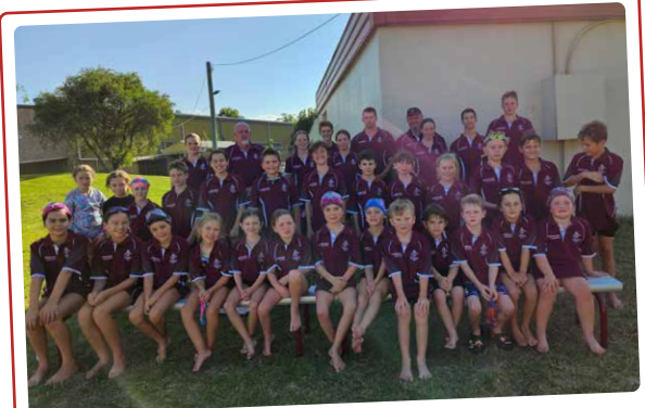
Supporting the Denman Amateur Swimming Club for their swimming season with team shirts