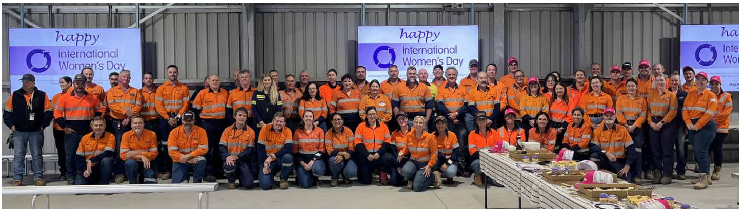
International Women's Day 2025