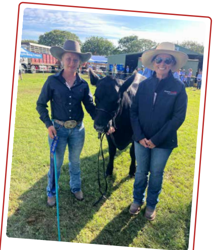
Upper Hunter Show