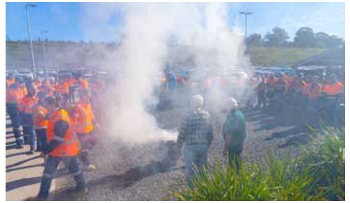
Mount Pleasant Operation NAIDOC smoking ceremony

At Mount Pleasant Operation, we are proud to continue our support of NAIDOC Week, celebrating the history, culture, and achievements of Aboriginal and Torres Strait Islander peoples. NAIDOC is an important time for reflection, recognition, and connection, and we were honoured to once again stand alongside our community to support local events and initiatives that mark this meaningful week. This year, our teams at Mount Pleasant Operation were privileged to be presented with a piece of Aboriginal art by a Hunter Valley artist and we were also delighted to experience performances by Aboriginal dancers.