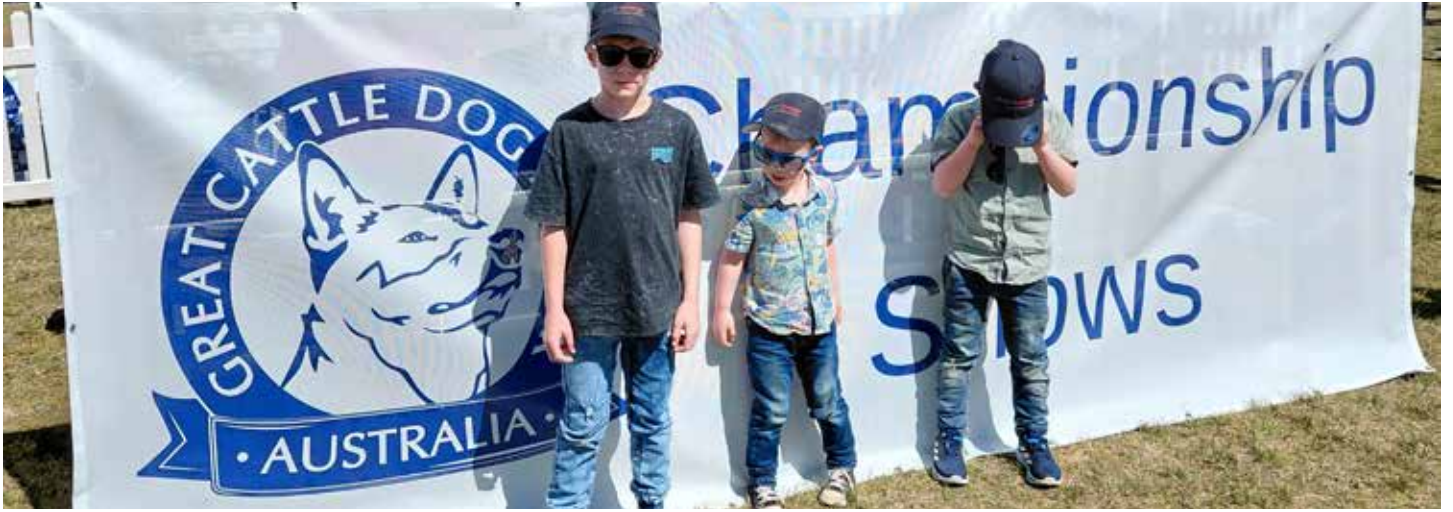
Great Cattle Dog Muster

We extend our sincere thanks to all the hardworking volunteers, organisers, and community members who make these initiatives possible. We're proud to stand beside you, and we remain committed to supporting these initiatives.