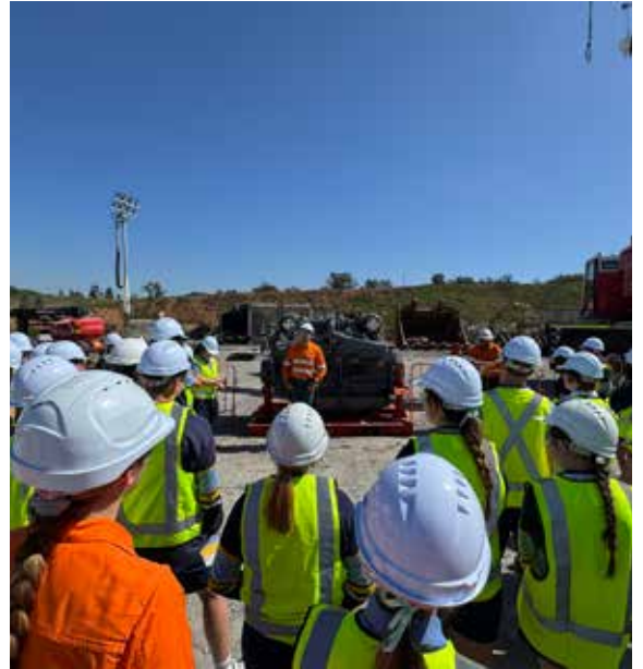
St Joseph's High School