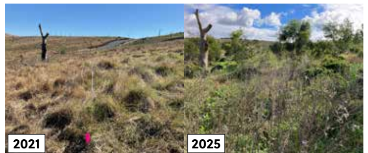
Rehabilitation areas Established in 2019 – Monitoring photos 2021 and 2025