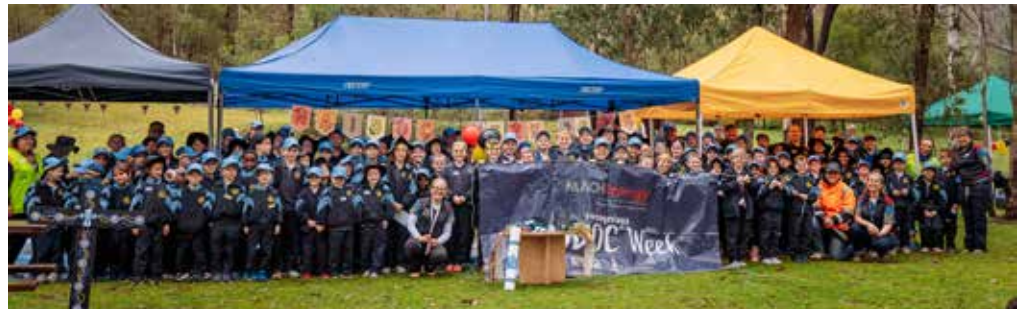
St Mary's Primary School Score – NAIDOC Celebrations at The Washpool NP

We are also pleased to share highlights from NAIDOC Week school celebrations, proudly supported through the ACDF. These events reflect our ongoing commitment to empowering the next generation and celebrating culture through education.