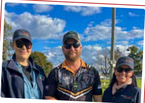
Aberdeen Tigers Sponsors Day