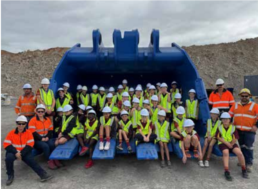
St James Primary School