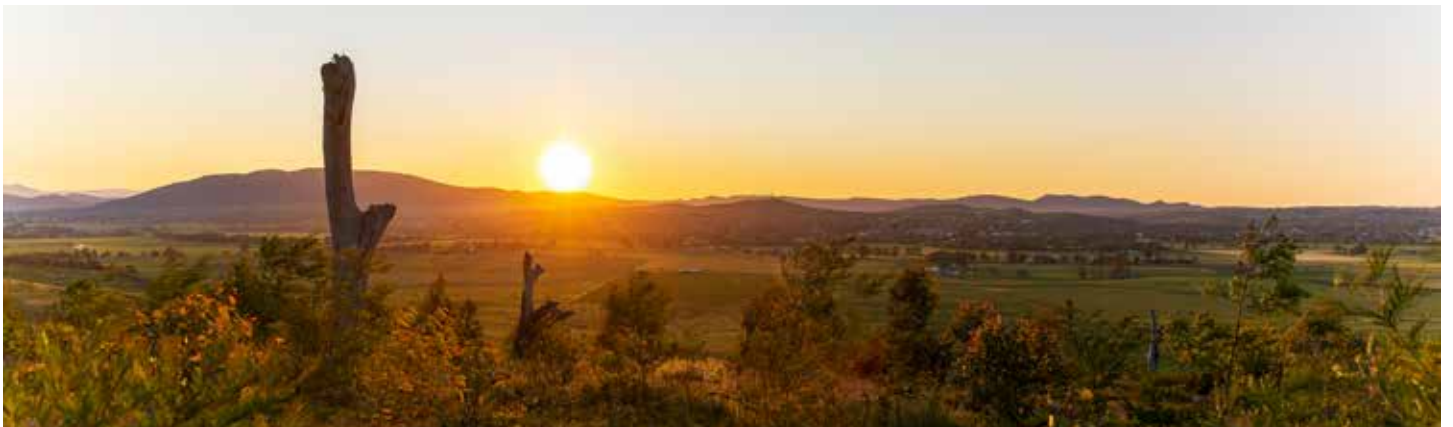
Mount Pleasant Operation Rehabilitation