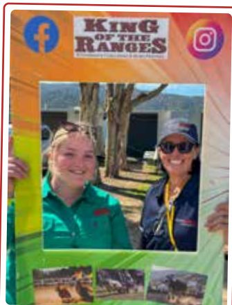
King of the Ranges Murrurundi