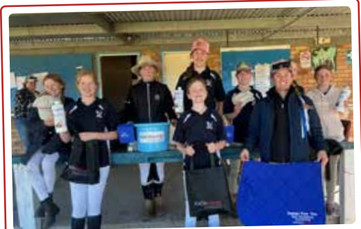
Denman Pony Club