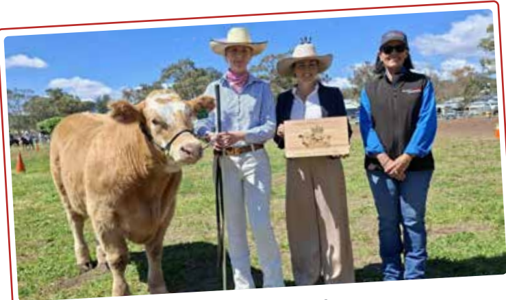
Merrriwa Springtime Show