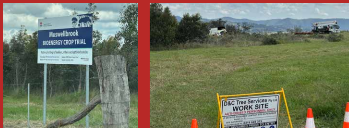
Pictured above left, the Biomass site on Roxburgh Road. Pictured above right, coppicing the trees in October.