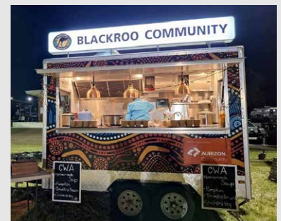
Pictured above, the Muswellbrook CWA were engaged to cook and serve free soup at dusk. The Blackroo mobile kitchen was perfect for the task.