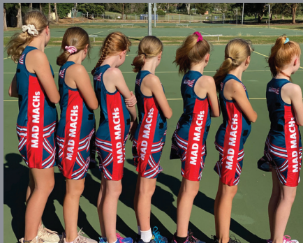
The MadMachs netball team

Supporting our local community! Although the 2020 Muswellbrook netball season is still to get underway, we have a feeling the Mad MACH'S will be the standout team in more than one way!